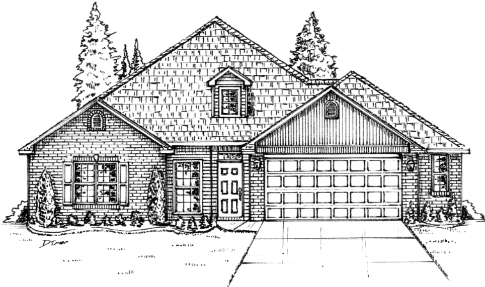
Elevation C (Optional dormer shown)